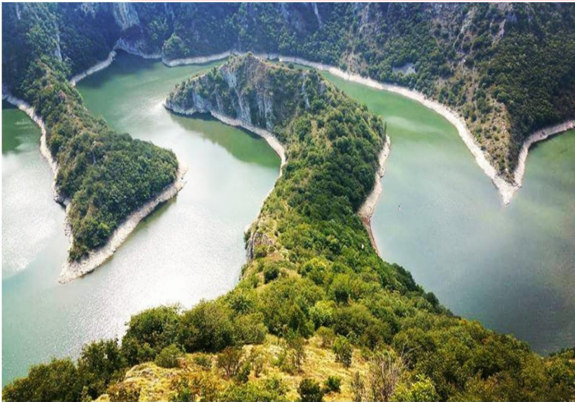
Uvac is my home, this is where I am at my happiest and totally at peace. I go to Uvac whenever I need to escape from the stress of everyday life and just sit there for hours contemplating my surroundings.

It is located in the centre of the Balkan Peninsula, in south-eastern Europe. The northern portion belongs to central Europe, but in terms of geography and climate it is also partly a Mediterranean country. Serbia is landlocked but as a Danube country it is connected to distant seas and oceans. Serbia is a cross roads of Europe and a geopolitically important territory. The international roads and railway lines, which run through the country's river valleys, form the shortest link between Western Europe and the Middle East.